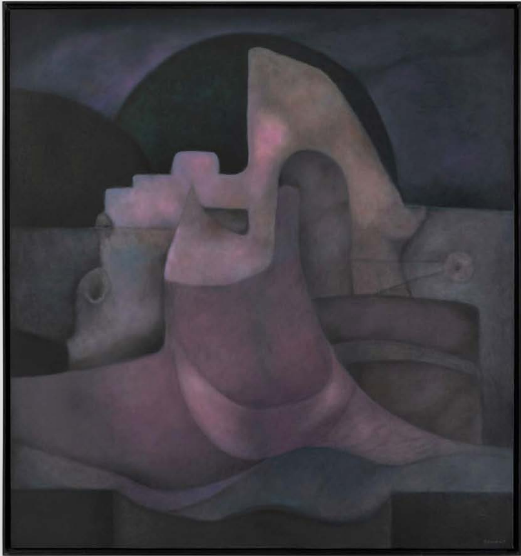
Preludio de un eclipse (Prelude to an Eclipse), 1996