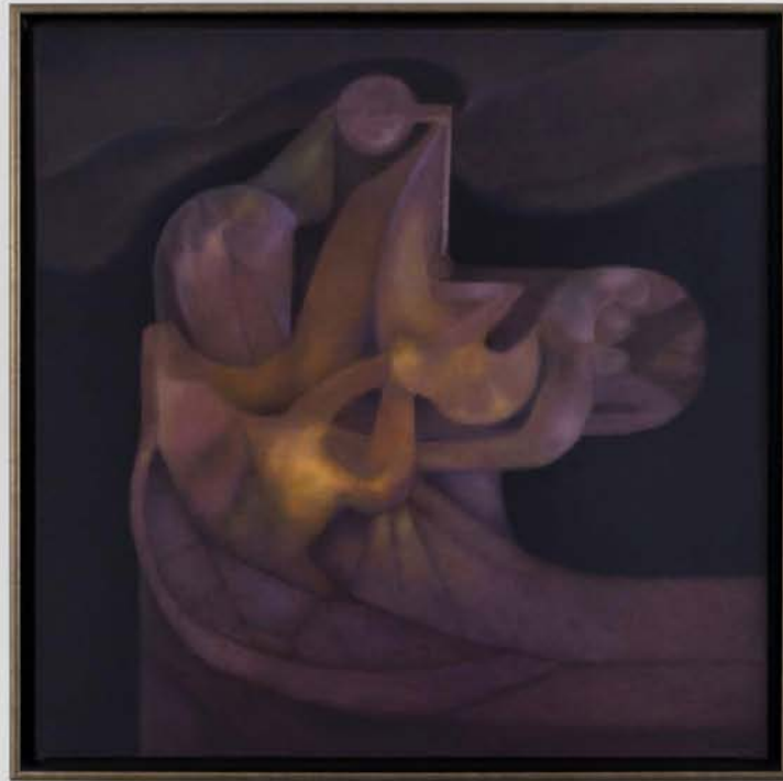
Monumento al crepúsculo (Monument to Twilight), 1996 oil on canvas 36 x 36 inches | 91.4 x 91.4 cm