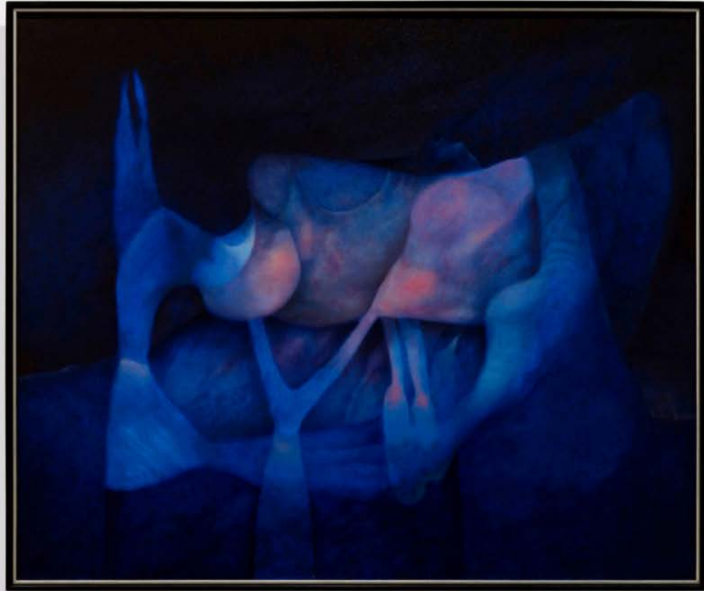
Umbral de la noche (Threshold of the Night) , 1993