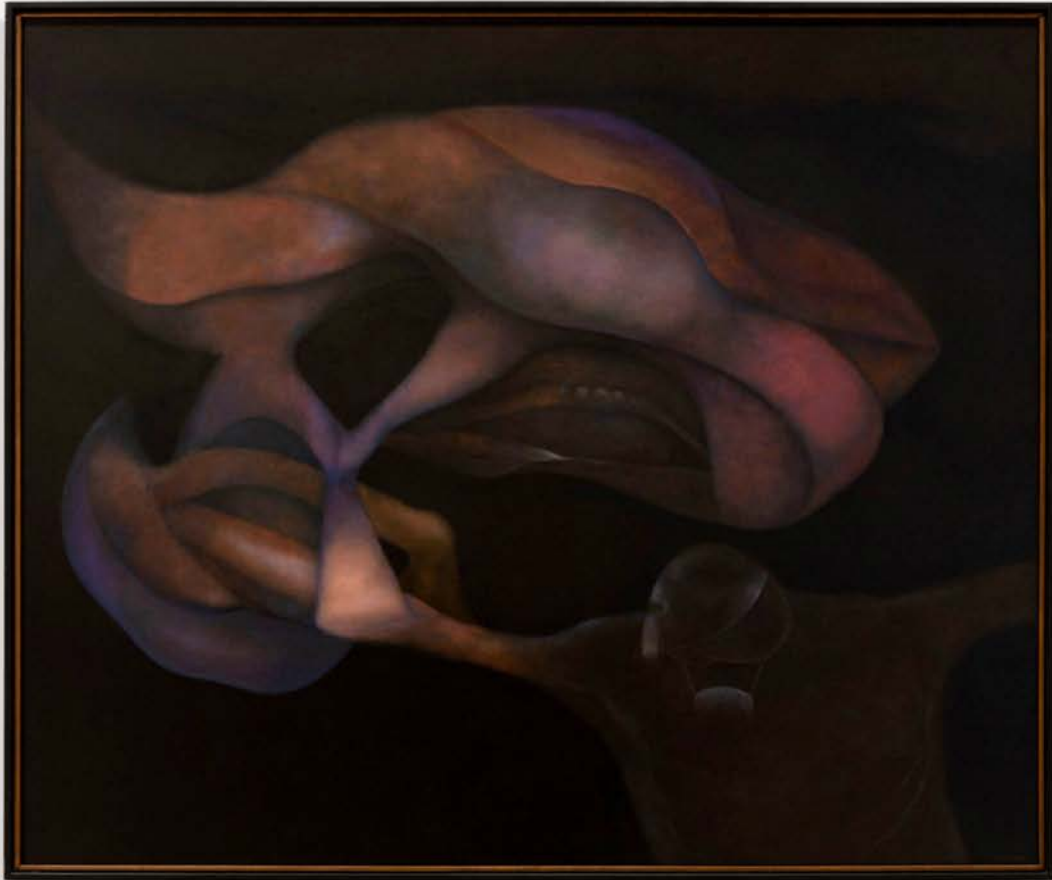
El Ilusionista (The Illusionist) , 1995