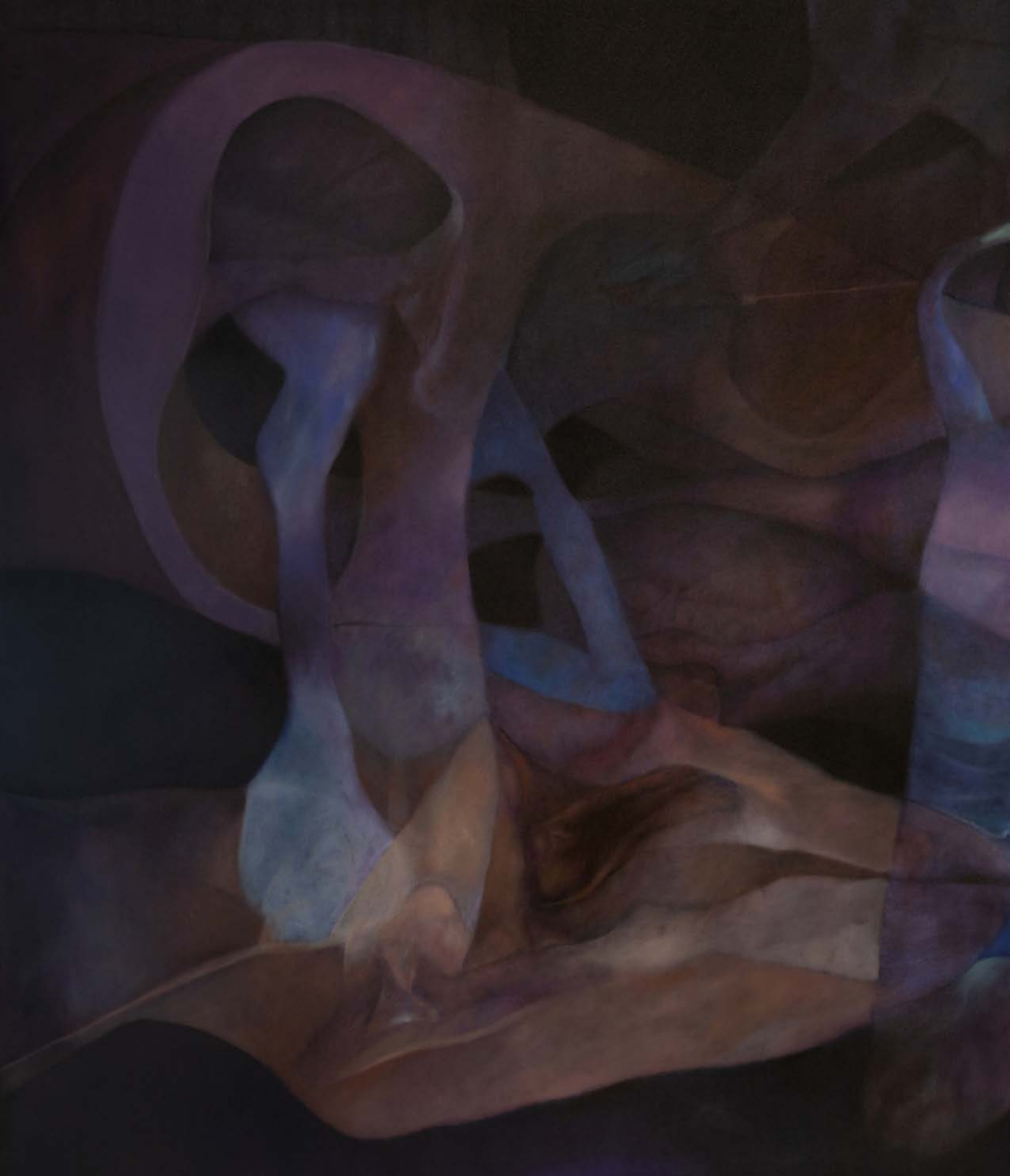
Detail of Espejismos de agua (Water Mirages) , 1990