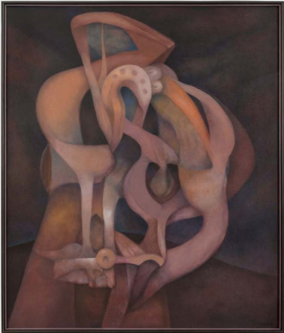
El vigía del estío (The Watchman of Summer), 1995