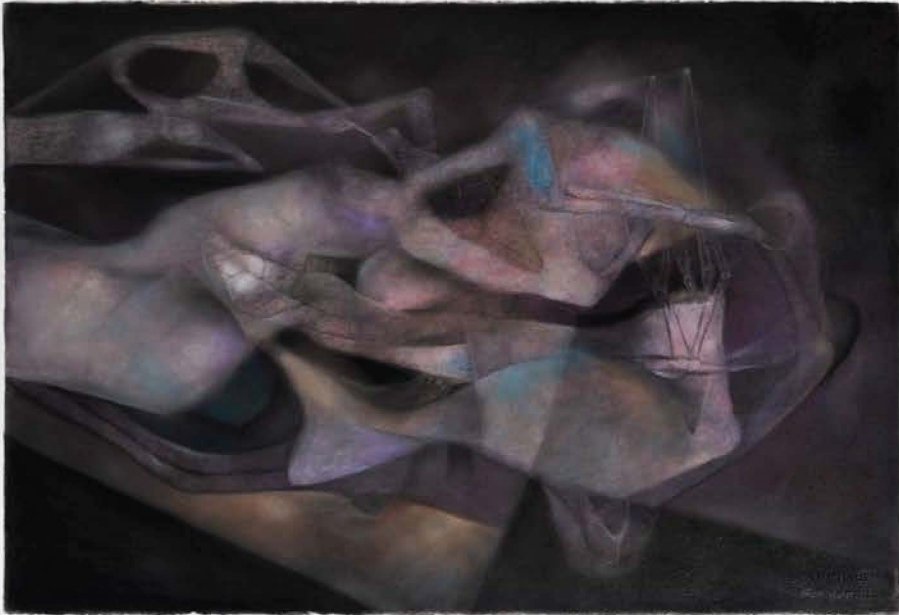
Untitled, n.d. mixed media on paper 22 x 30 inches | 55.9 x 76.2 cm