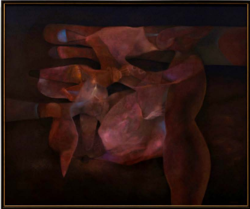
Recóndita armonía (Hidden Harmony) , 1994 oil on canvas 50 x 60 inches | 127 x 152.4 cm