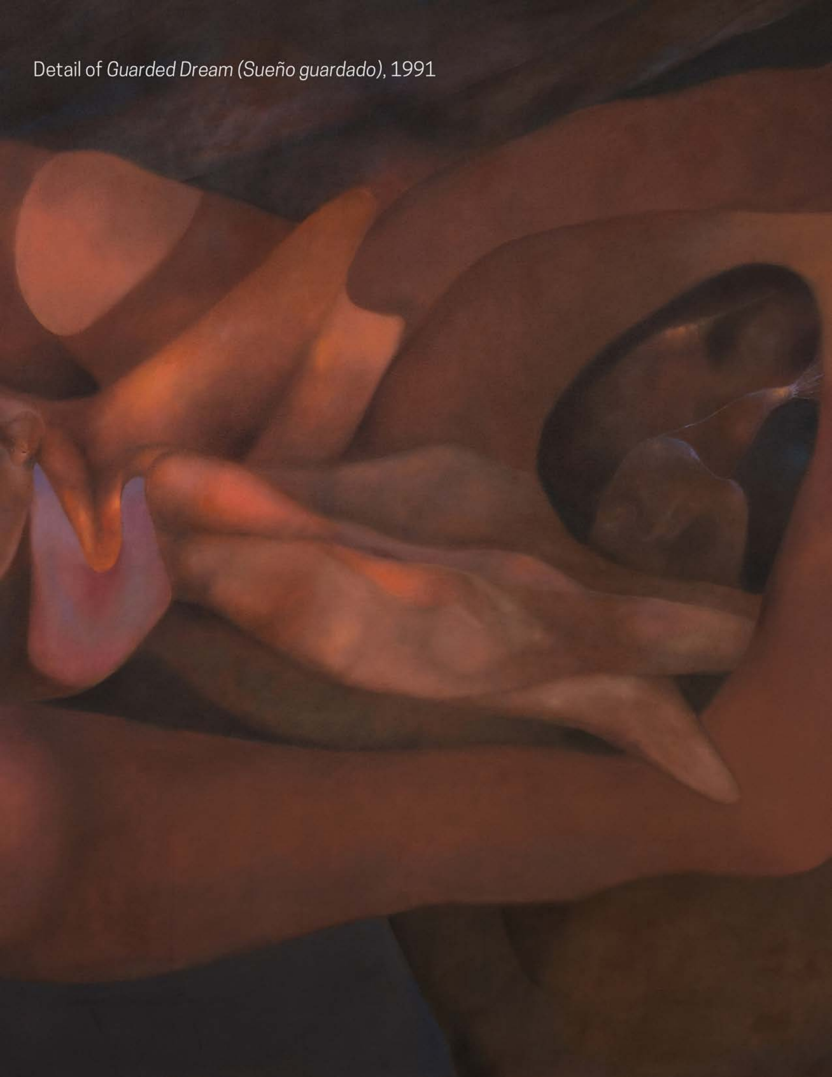
Detail of Guarded Dream (Sueño guardado) , 1991