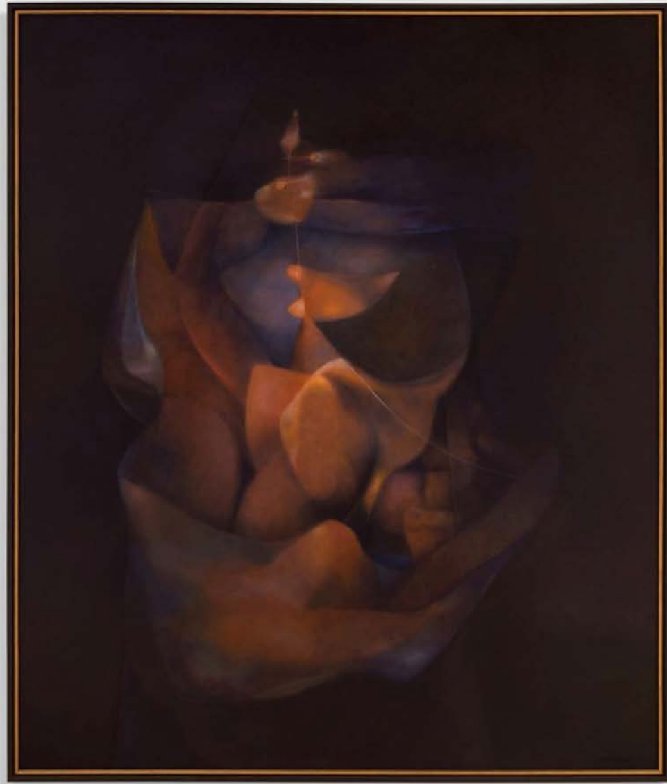
El candor del estío (Candor of Summer), 1990